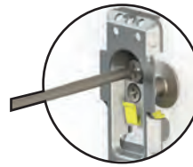
Height adjustment Up to 11mm.