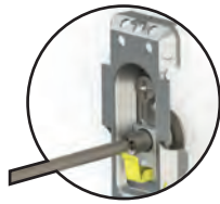
Depth adjustment. Up to 10mm.

Nominal capacity of 50 kgs. per hanger. EN 15939 on A setting. Fixing screws as indicated.