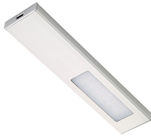
In Cabinet light off