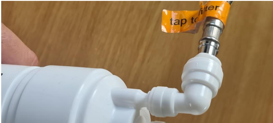
Figure 11. Fit white label flexi tail to the OUT connection on the new water filter to connect to boiler inlet

Pressing in firmly until feel click into position.