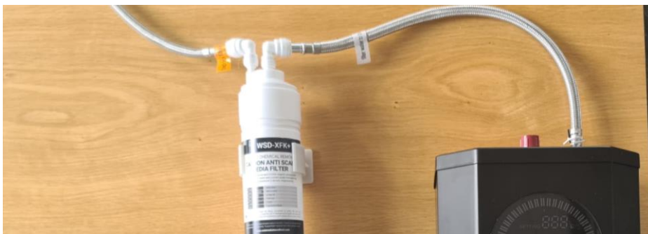
Figure 14. Final assembly picture of new filter fully installed

Please note when turning back on tap to use check no leaks at any connections.