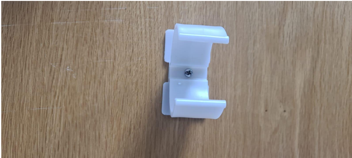
Figure 13. Push filter into bracket if bracket is being used.

Figure 12. Attach the new bracket to cupboard in place of old bracket in the same screw hole if bracket is to be attached. New bracket attached photo attached.